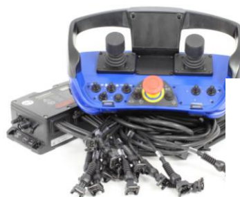
Radio control Scan Reco Maxi 3-0-3