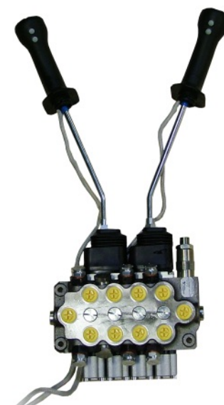
Lightweight with el. on-off 2xTR55/4