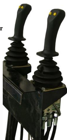
Joystick with hydr.- pre-control FRV 60/8-P