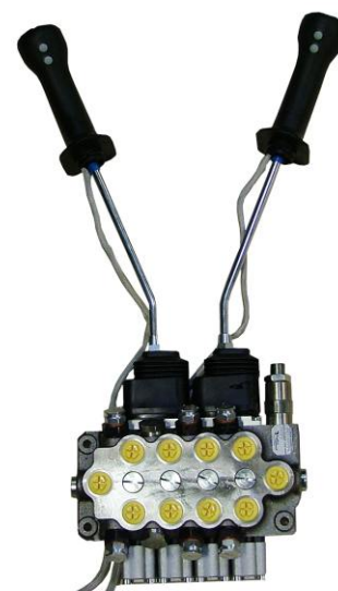
Lightweight with el. on-off 2xTR55/4