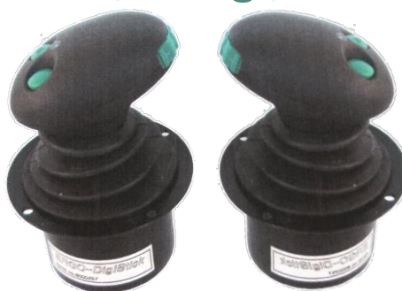
Full electric joystick BC/60-8