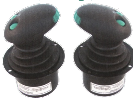
Full electric joystick BC/60-8