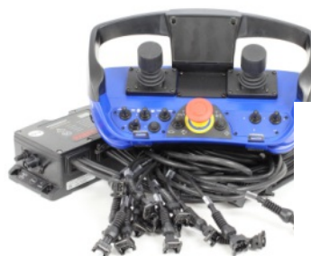
Radio control Scan Reco Maxi 3-0-3